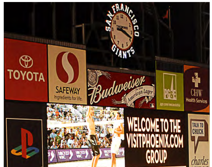
The Scoreboard at AT&T Park Welcomes the Phoenix CVB group.