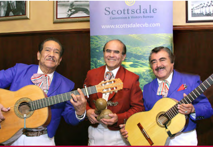
A Mariachi trio adds a southwest touch to the Phoenix CVB media event in Los Angeles.