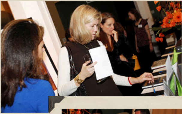
Above and Right - Guests view Silent Auction items at Art is in the Air

Art is in the Air is the annual fundraising event for The Imagine Bus. The event attracts an affluent crowd of 350 art lovers and supporters of art education from San Francisco, Sonoma and Marin. The Silent Auction is a highly anticipated element of the event, raising much needed funds for arts education.