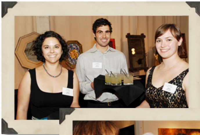
Above - Cocktail service by Le Tourment Vert

Art is in the Air is the annual fundraising event for The Imagine Bus. The sophisticated evening features student artwork, a silent auction, live art demonstrations, a sale of custom art created by well-known visual artists and delicious food provided by top San Francisco restaurants.